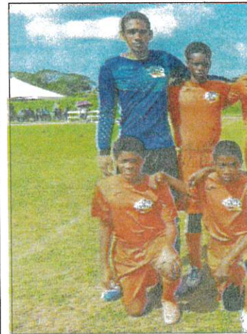
BIG WINNERS: Club Sando's Under-14 F